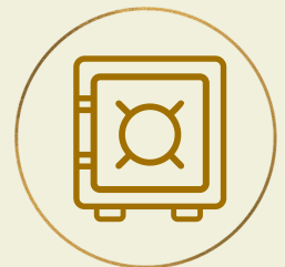
Deduction from your investment account