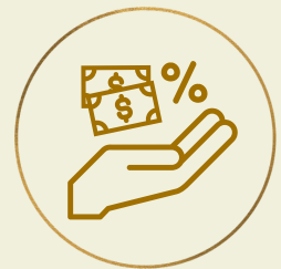
Hourly rate/Ad hoc fees

We accept the following payment methods for our advice fees: