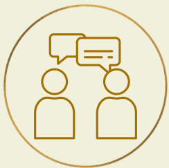
Initial advice and implementation

Our agreed advice and service fees may include charges for: