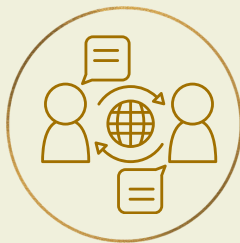
Ongoing /Annual advice and services