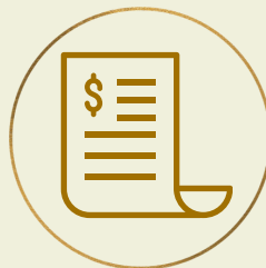
Deduction from your superannuation account